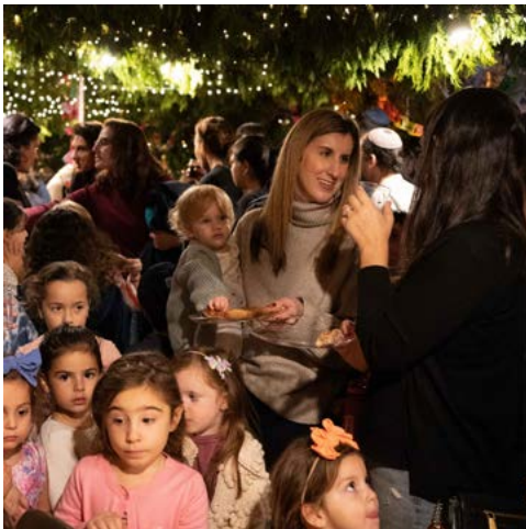
A small peek from our incredible Community Unity Succah Celebration. Children of all ages enjoyed the fun in our beautiful Succah.