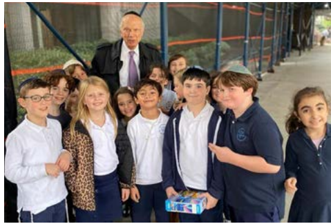
The RASPEDS third graders ran into a familiar face on their walk back to school after a visit to the Sunrise Senior Center.