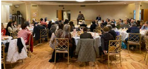
The Sisterhood Brunch was a great success. (See story, Page 4.)