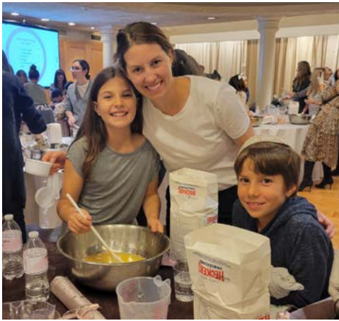
Thank you to the RASPEDS Parent Association and The Challah Girls for hosting a delightful Women and children' Challah Bake.