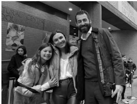
Thank you parents for joining.