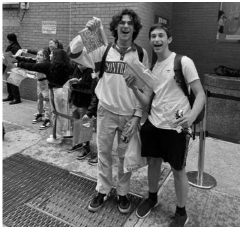
Hebrew School children distributing handmade shmurah matzah to the community.