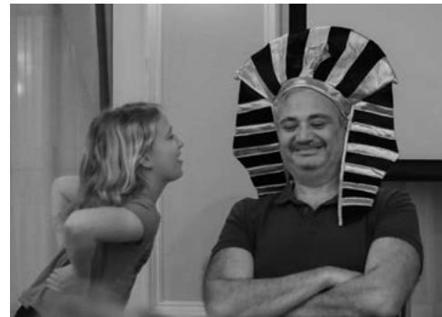
Let my people go!

Just look at these pictures! With these small leaders, our freedom is defended