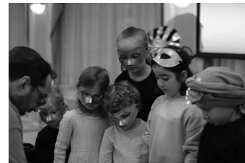
Leaders of the Jewish people.