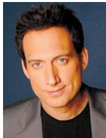
Elon Gold to serve as Master of Ceremonies for our Dinner Dance