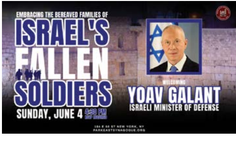
On Sunday, June 4 we welcomed Yoav Galant, Israeli Minister of Defense embracing the bereaved families.