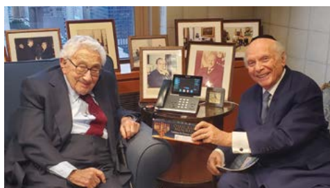
Sharing the light of Chanukah, December 2022.